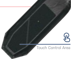
Touch Control Area

BLUETOOTH PAIRING: Hold Left and right together for \geq 2s